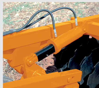
Cylinder lock for safety transportation.